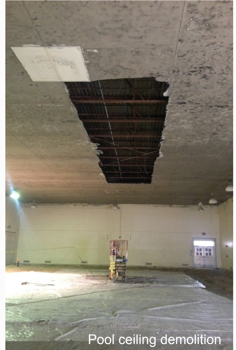
Pool ceiling demolition