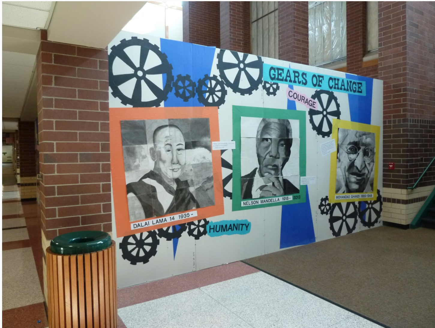
Student art at main entrance construction partitions