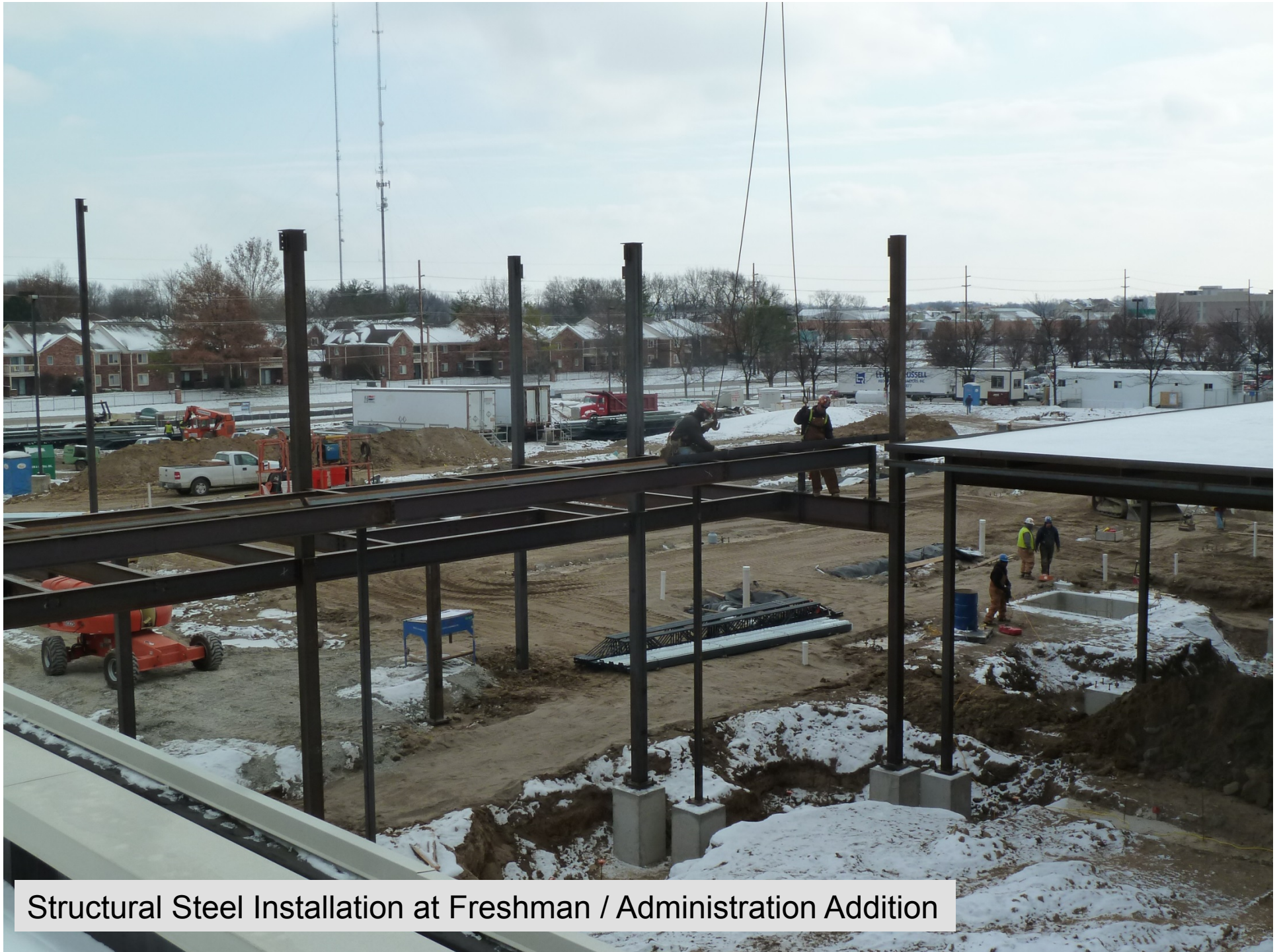
Structural Steel Installation at Freshman / Administration Addition