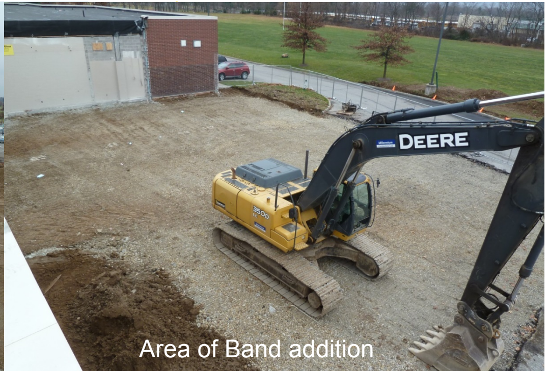
Area of Band addition