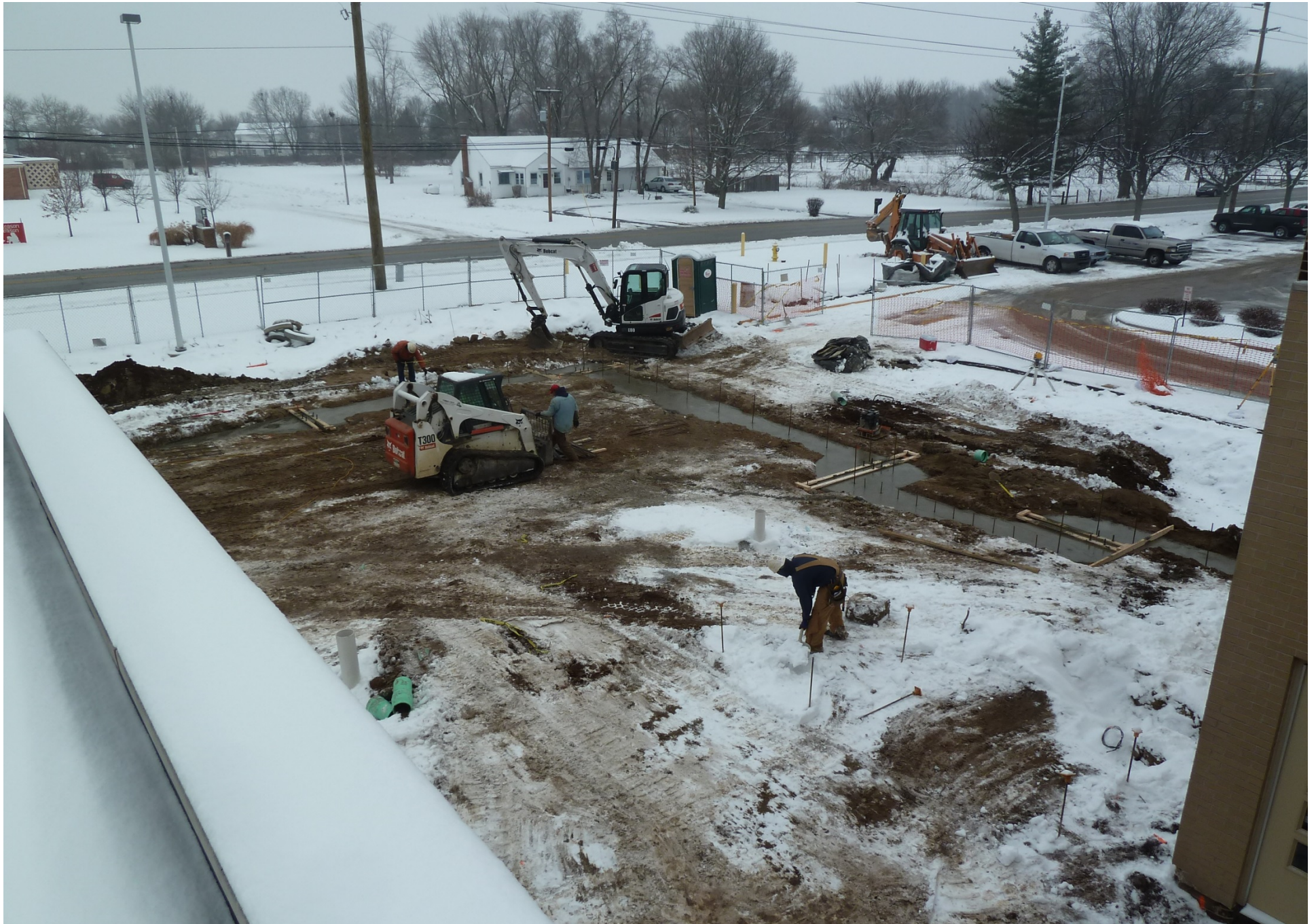
North addition (6 th grade classrooms) concrete foundations in progress