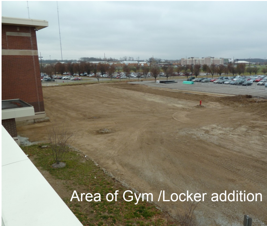
Area of Gym /Locker addition