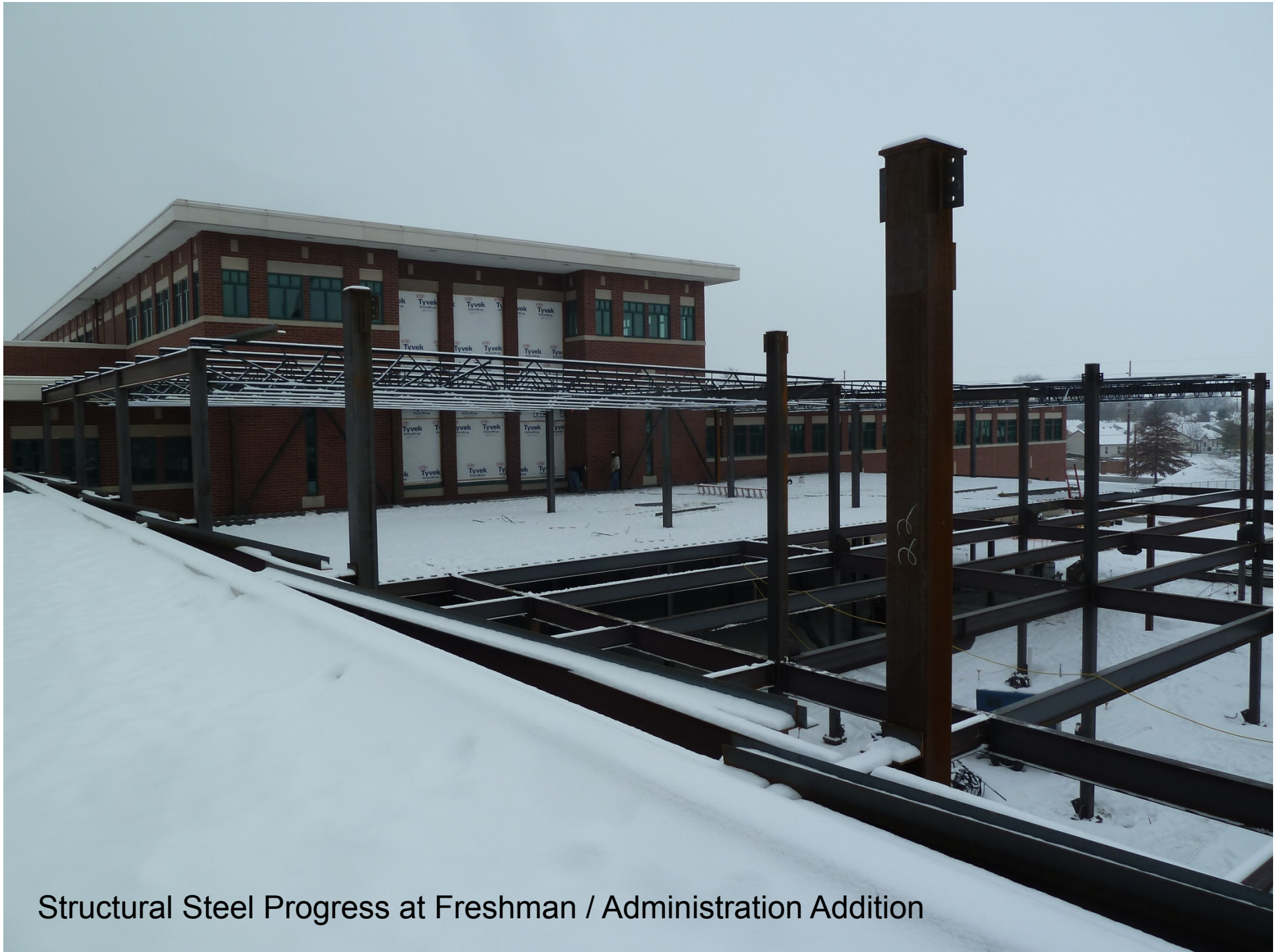
Structural Steel Progress at Freshman / Administration Addition