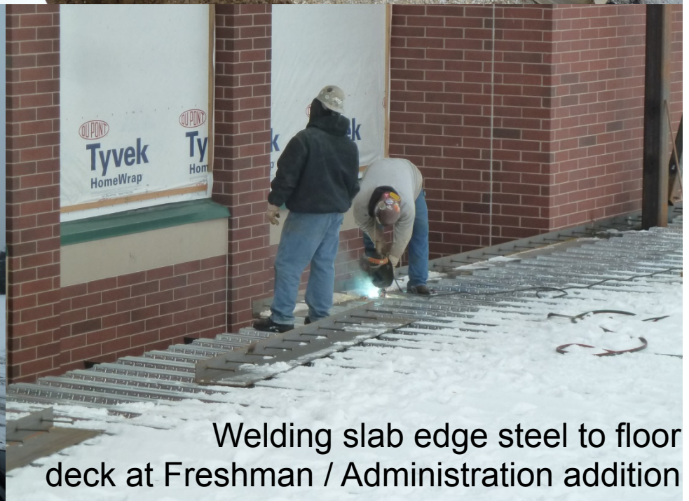
Welding slab edge steel to floor deck at Freshman / Administration addition