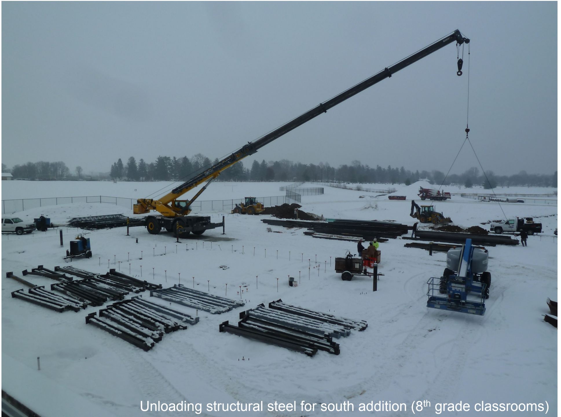
Unloading structural steel for south addition (8 th grade classrooms)