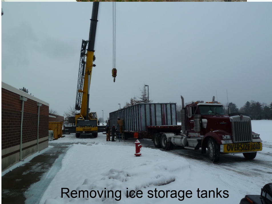
Removing ice storage tanks